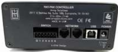
RatPak Push Button Controller: https://www.arrayolutions.com/ratpak-pbc