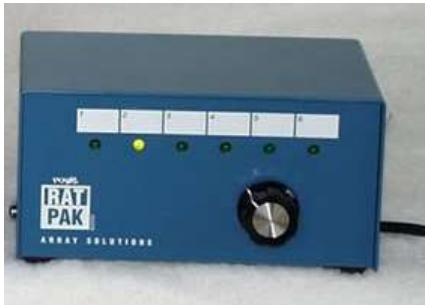
RatPak Rotary Controller: https://www.arrayolutions.com/ratpak-rc