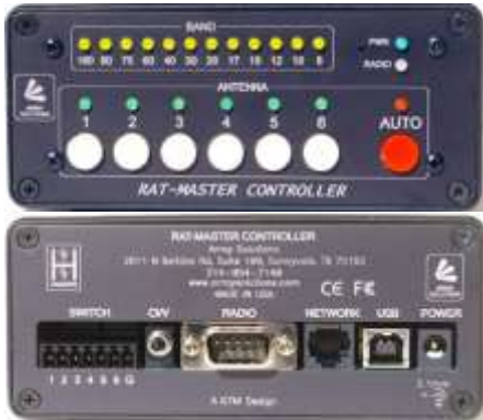
RatMaster, just like the RatPak push button controller but with built-in band decoder: https://www.arrayolutions.com/ratmaster